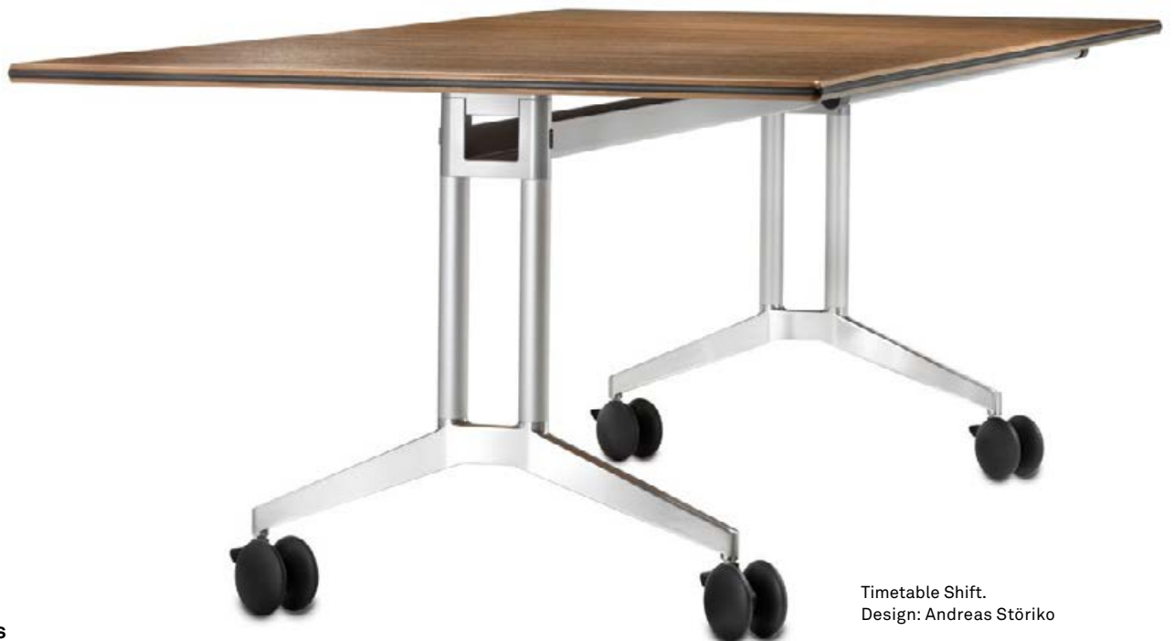
Timetable Shift. Design: Andreas Störiko

And what's more, Timetable Shift offers seamless solutions on demand by combining static Logon tables in suites that are sub-divided by folding partitions, extracting optimal performance from high-value communication-driven space.