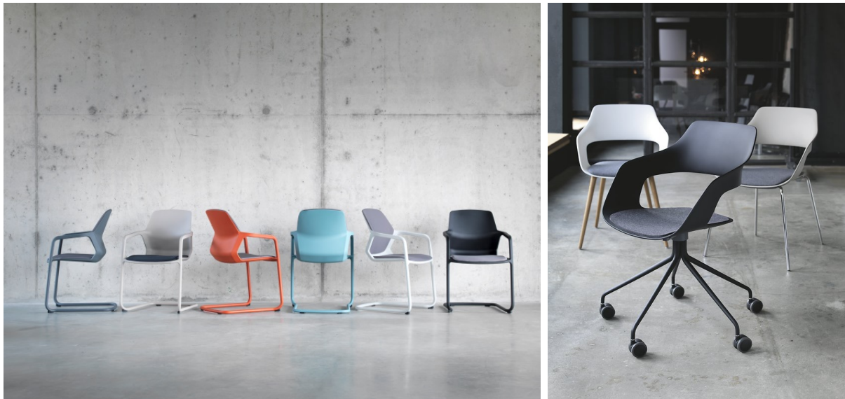
Photo left: Colourful eye-catcher that could become a cool must-have: Metrik cantilever chair, design: WhiteID. Photo right: A variety of options for all eventualities: Occo meeting range, design: Jehs & Laub.