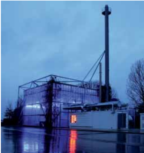
Co-generator powered by renewable raw materials